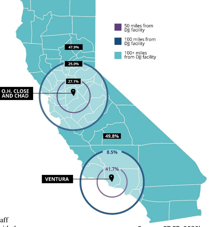
Figure 2. Distance from DJJ facilities to youths' counties

Families felt left in the dark about their child's well-being and COVID-19 status amid the recent outbreak (Family Interviews, 2020). Reportedly, DJJ did not provide some youth who tested positive for COVID-19 with basic information about their condition (Family Interviews, 2020). Staff did not clearly presented youth over age 18 with the option to fill out paperwork waiving their medical